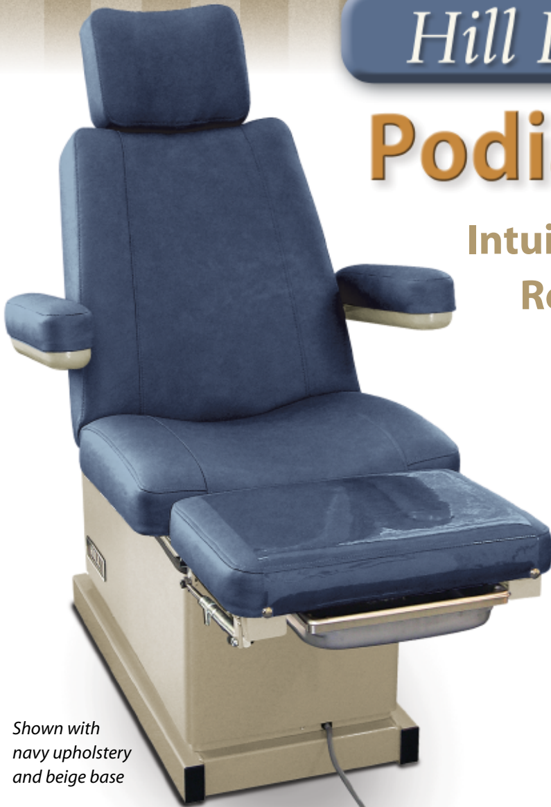
Shown with navy upholstery and beige base