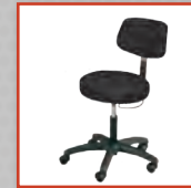
Air Stool with Back