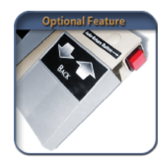
Auto-Return Switch Automatically repositions the chair for next patient