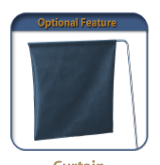
Curtain Adjusts in height