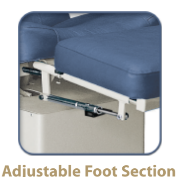
Locks at any angle down to 85.° Extends 12" for taller patients