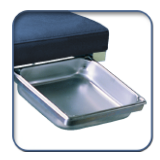
Deep Adjustable Pan Slides out from under foot section and adjusts in angle