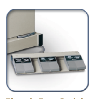
Electric Foot Pedals Adjust the height, tilt and recline