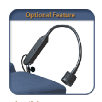
Flexible Arm Lamp Removable; comes standard with 110 outlet in base.