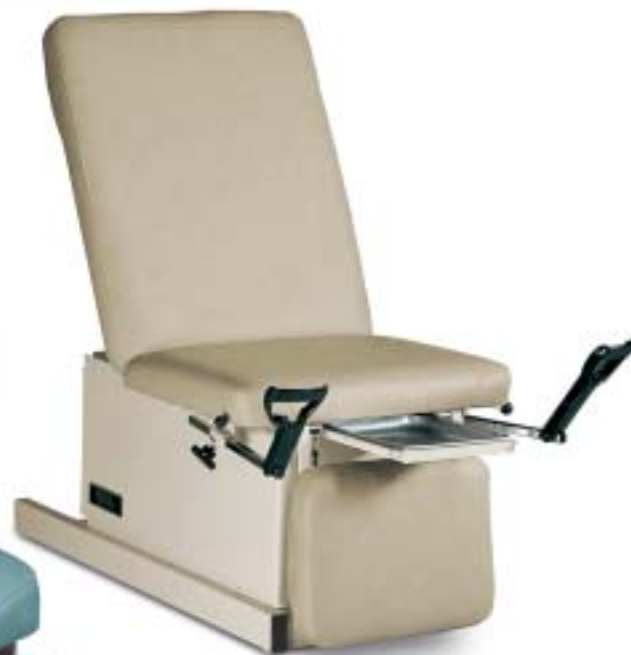
Standard Model HA90MD

Shown with optional contour upholstery, adjustable headrest and fold-down armrests